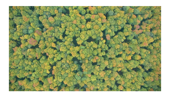
Fig. 2. Very high-resolution image. The aerial image shows an intensively managed, beech-dominated age-class forest of the region Hainich-Dün. The resolution permits accurate identification of gap objects up to a minimal size of 1 \text{ m}^2 . After orthorectification, only the central 1-ha square of the image is used for gap analysis.

\approx 250 m (Figs 1 and 2; Figs S1 and S2 in Supporting information). This state-of-the-art UAV was recently developed by the Institute of Aerospace Systems/TU Braunschweig in conjunction with the Andromeda-Project (Chmara 2010). The UAV has a wing span of 2 m and weighs 6 kg. It can fly automatically along any predefined spline-based trajectory for a time span of 60 min and makes every 3-s an image. All images were orthorectified based on data recording of the internal UAV orientation, GPS position and a digital terrain model. Orthophotos were converted into binary images, and gap polygons were manually segmented to create shapefiles (a geospatial vector data format digitized with ArcGIS-9.3 software) as accurate as possible.