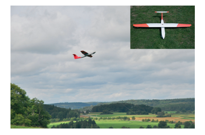
Fig. 1. Start of the unmanned aerial vehicle Carolo P200. Initially, the UAV gets manually started. Once it has reached the desired height, it can fly automatically along any predefined spline-based trajectory.